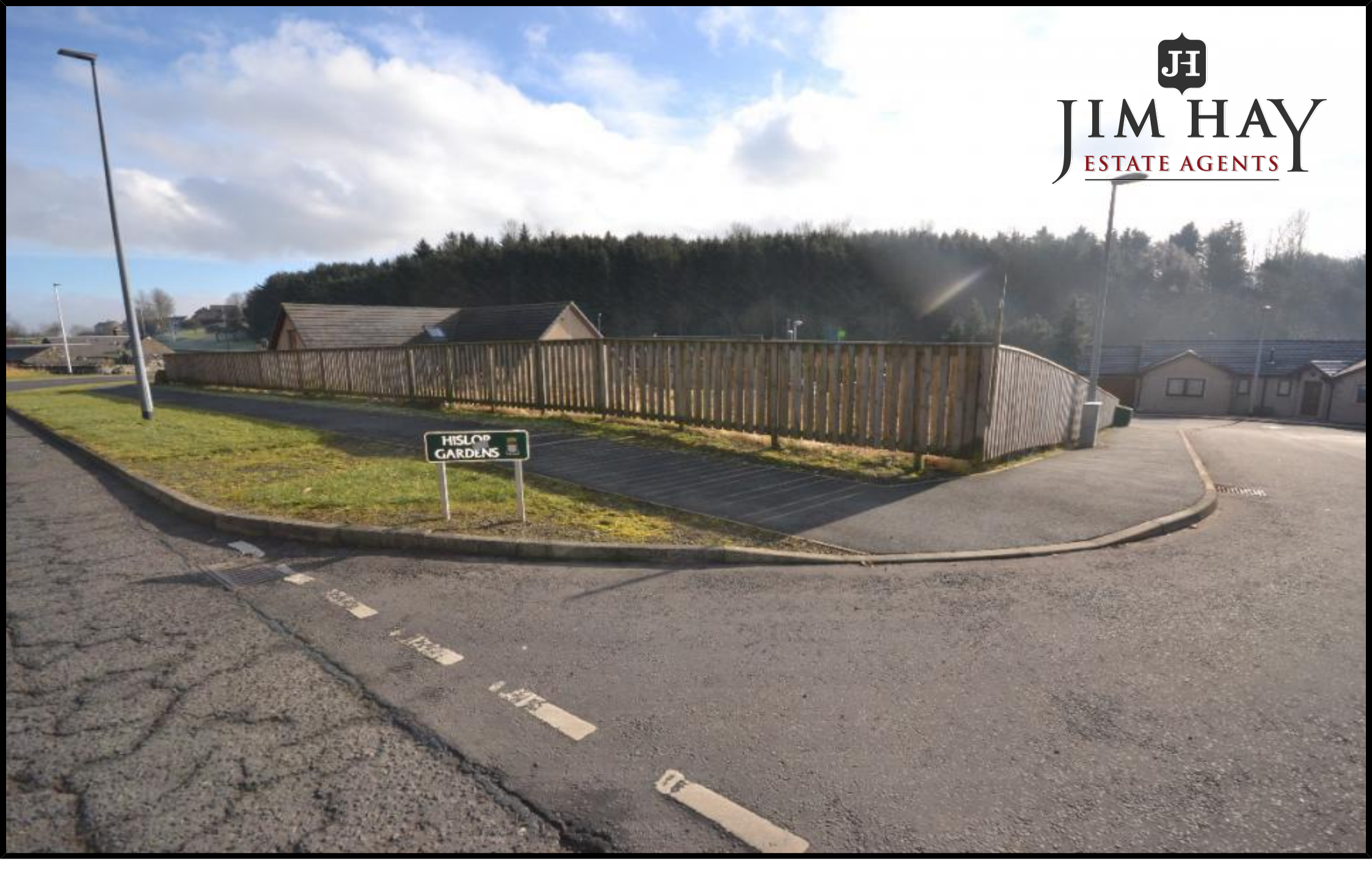
Plot No 1 Hislop Gardens Hawick TD9 8PH