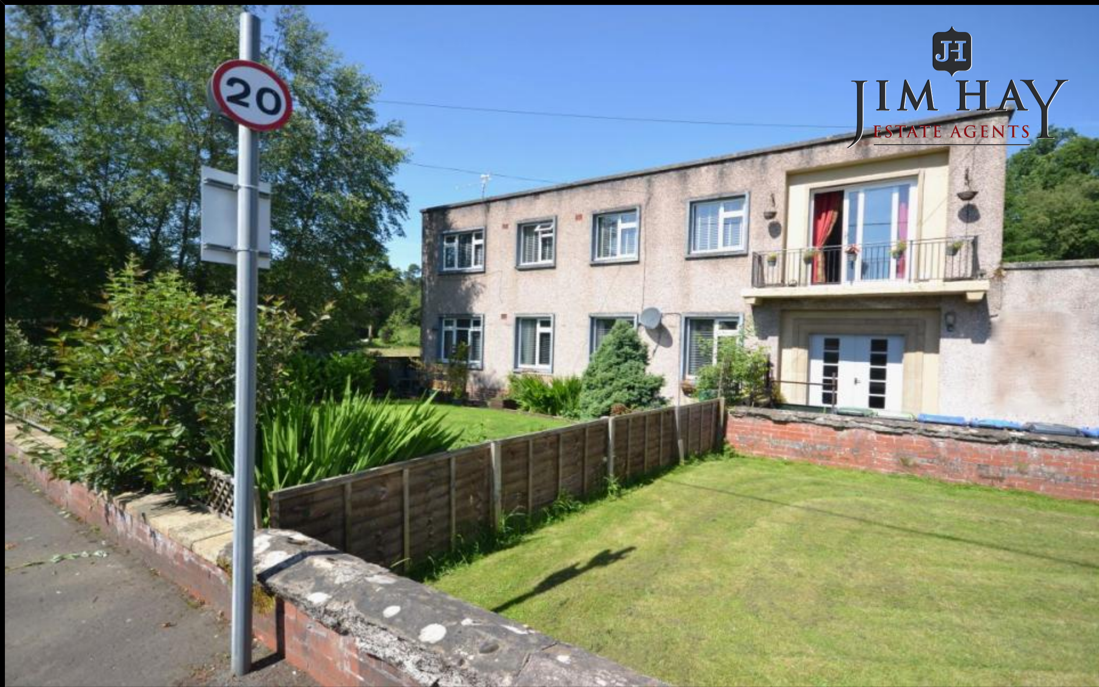
1 Police House North Hermitage Street Newcastleton TD9 0RZ