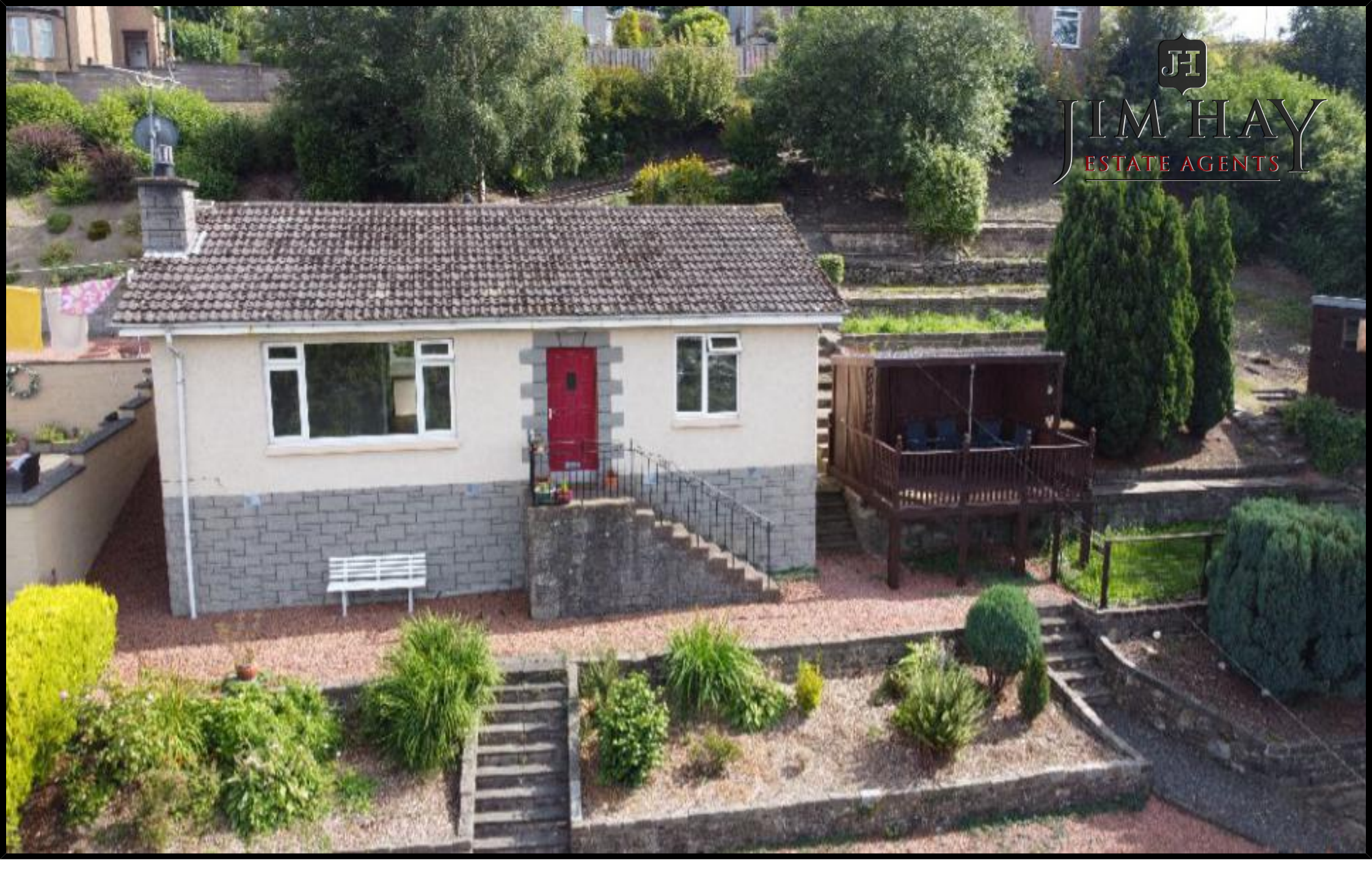
Mindelo 32 Weensland Road Hawick TD9 9NP