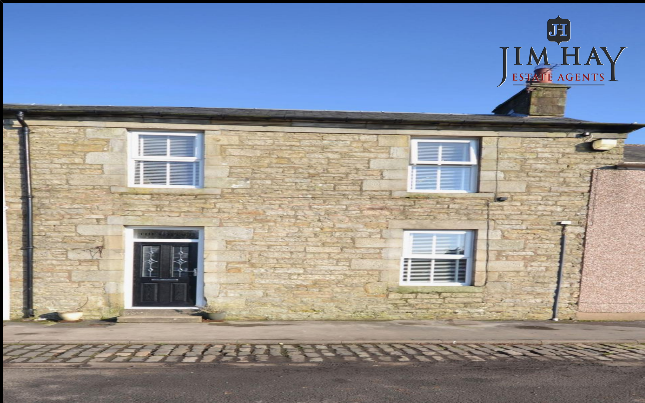
The Cottage Douglas Square Newcastleton TD9 0QU