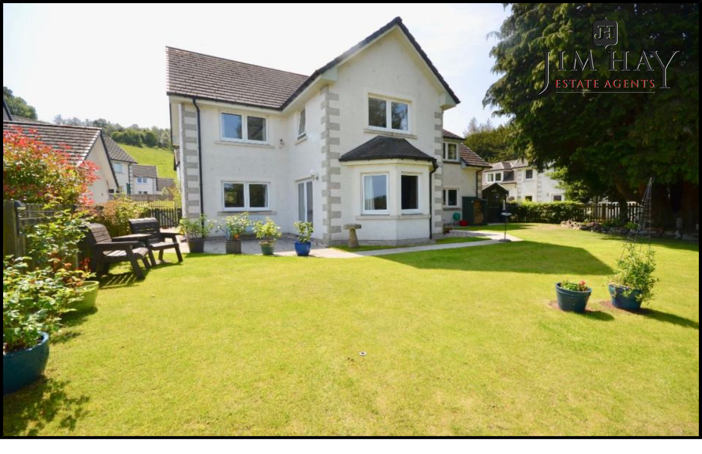
Godrevy House 16 Heronhill Close Hawick TD9 9RA