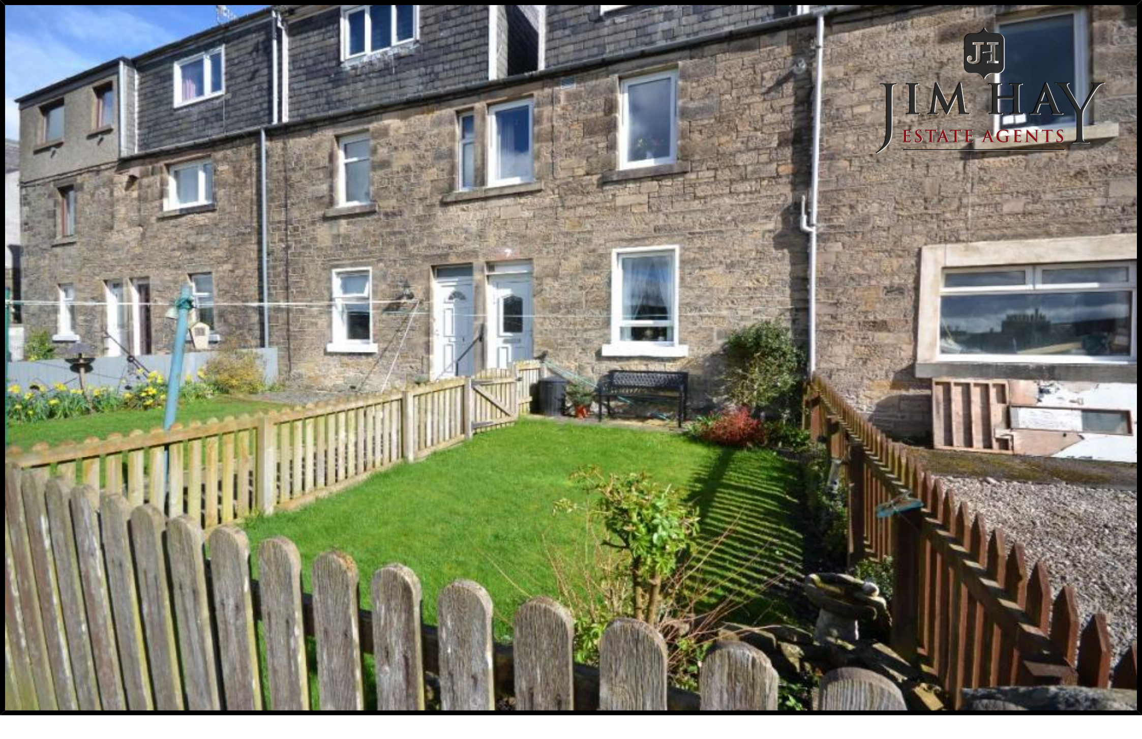
7 Waverley Terrace Hawick TD9 9JT