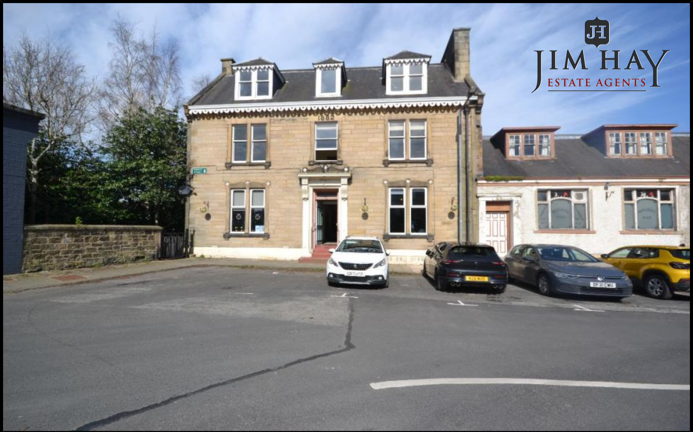
Buccleuch Hotel 1 Trinity Street Hawick TD9 9NR